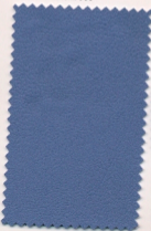
Ref: VALENCIA 3001 LAVENDER